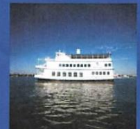
Cruise Around Charleston Harbor