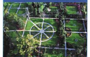
Visit Middleton Place and Gardens