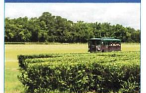
Tour Charleston Tea Gardens