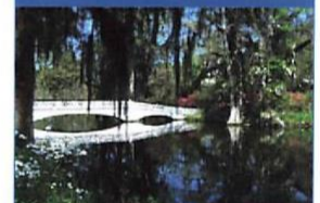
Take in the Picturesque Views of Charleston

Diamond Tours inc. Bringing Group Travel to a Higher Standard®