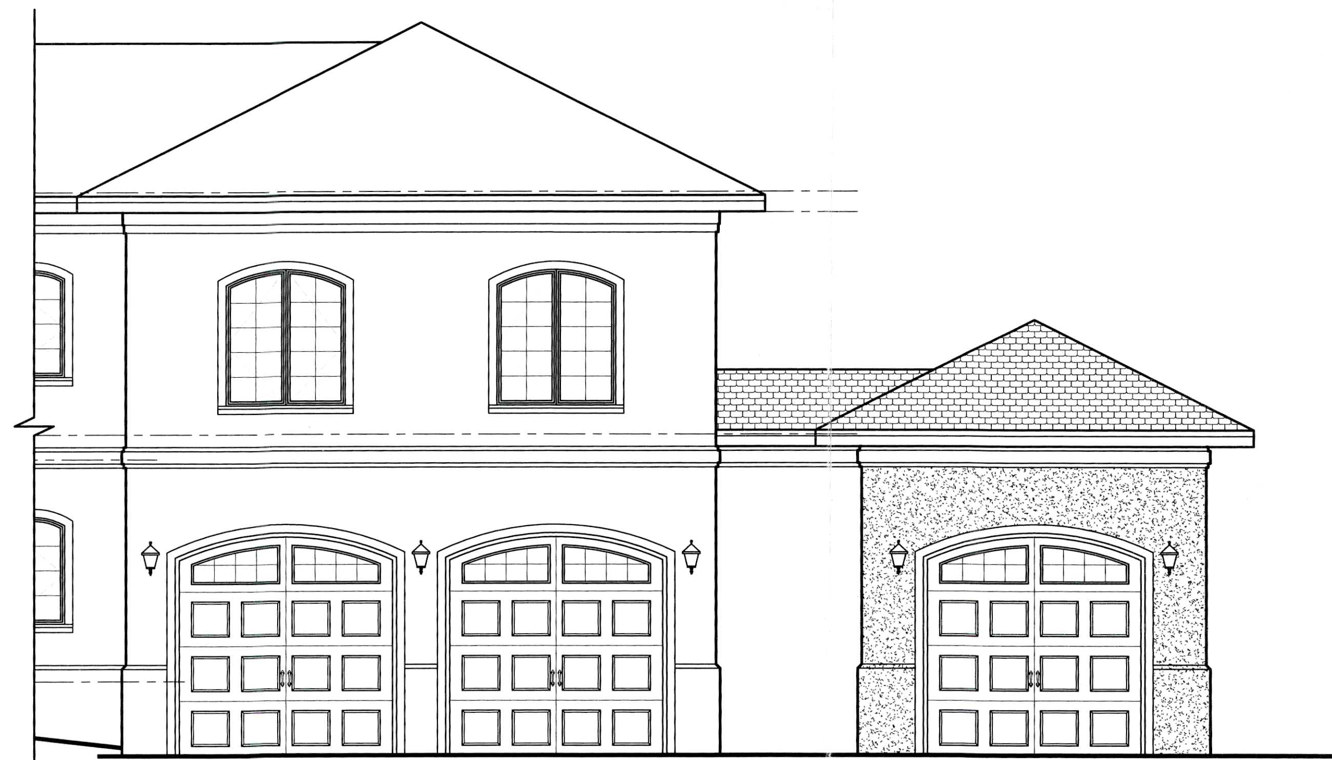
PARTIAL FRONT ELEVATION SCALE: 1/4"=1'-0"