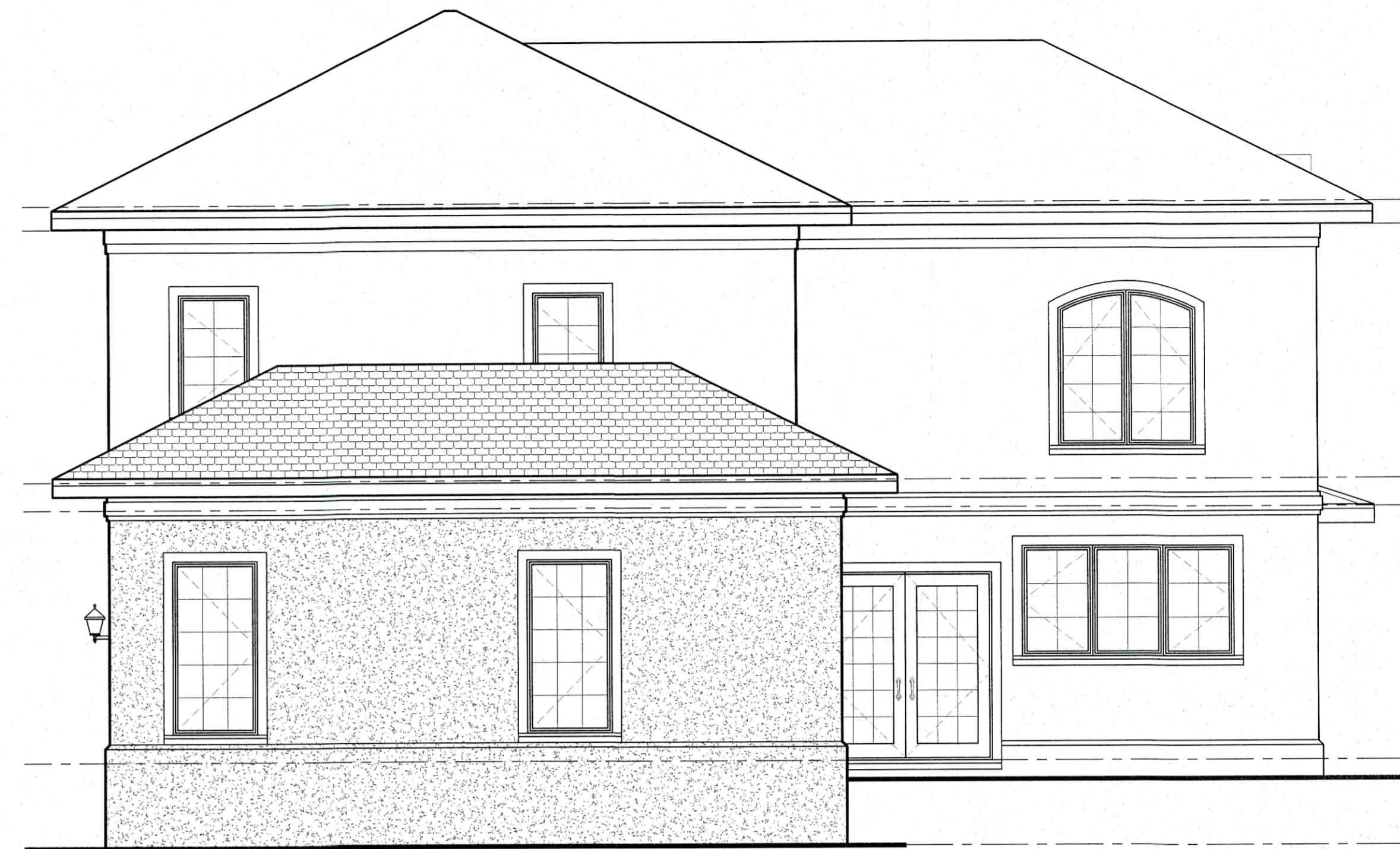
PARTIAL SIDE ELEVATION SCALE: 1/4"=1'-0"