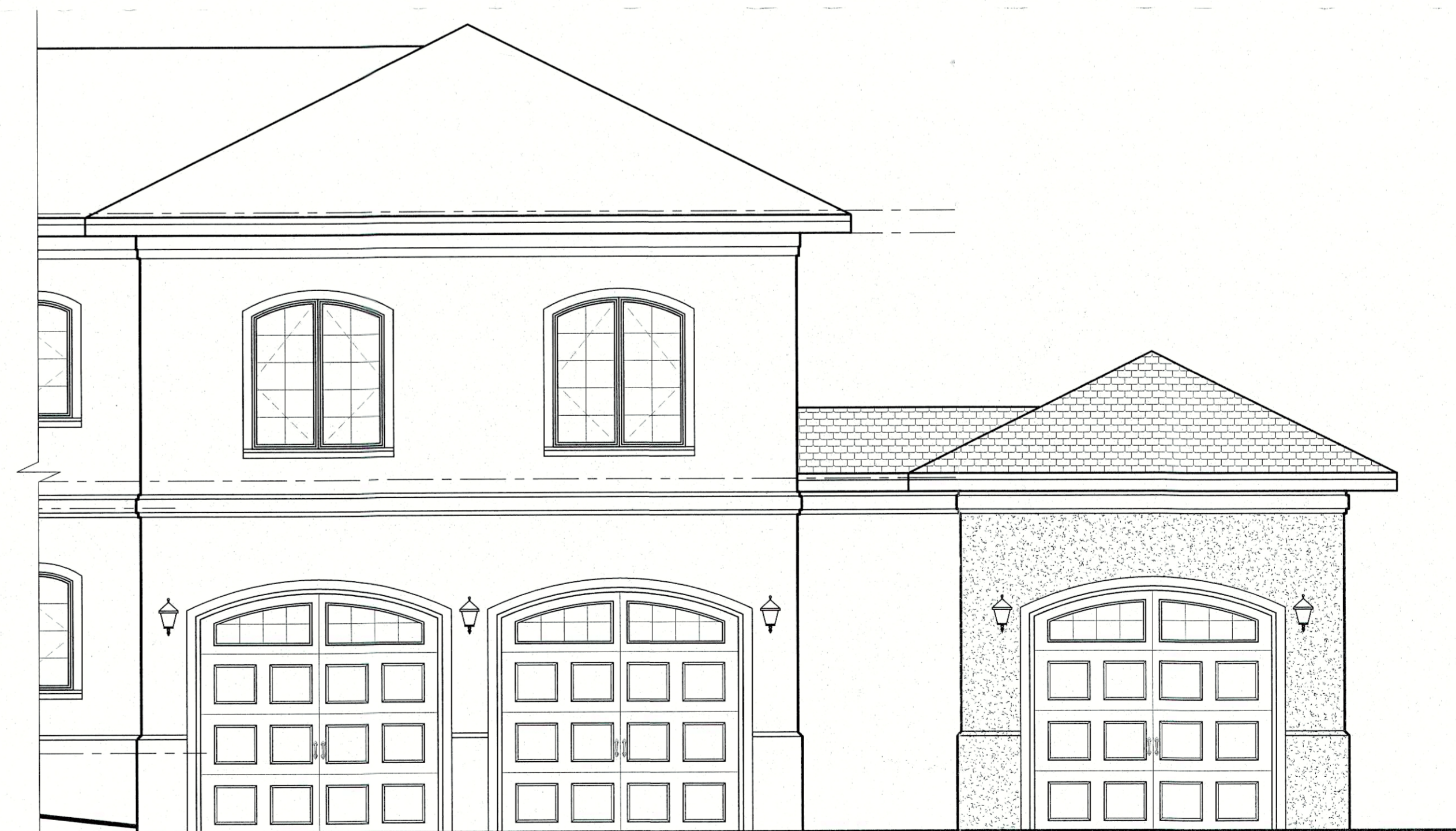
PARTIAL FRONT ELEVATION SCALE: 1/4"=1'-0"