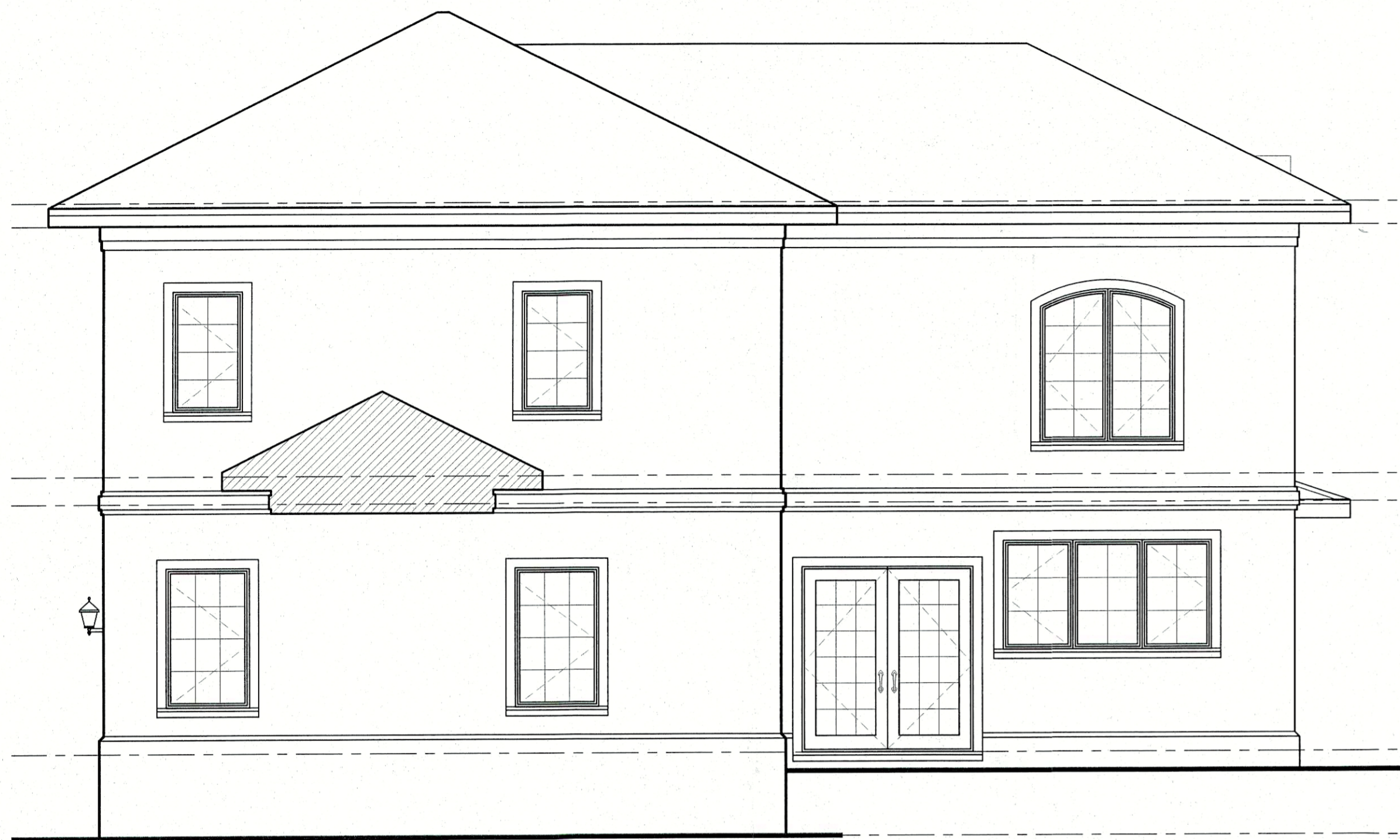
PARTIAL SIDE ELEVATION THROUGH BREEZEWAY SCALE: 1/4"=1'-0"