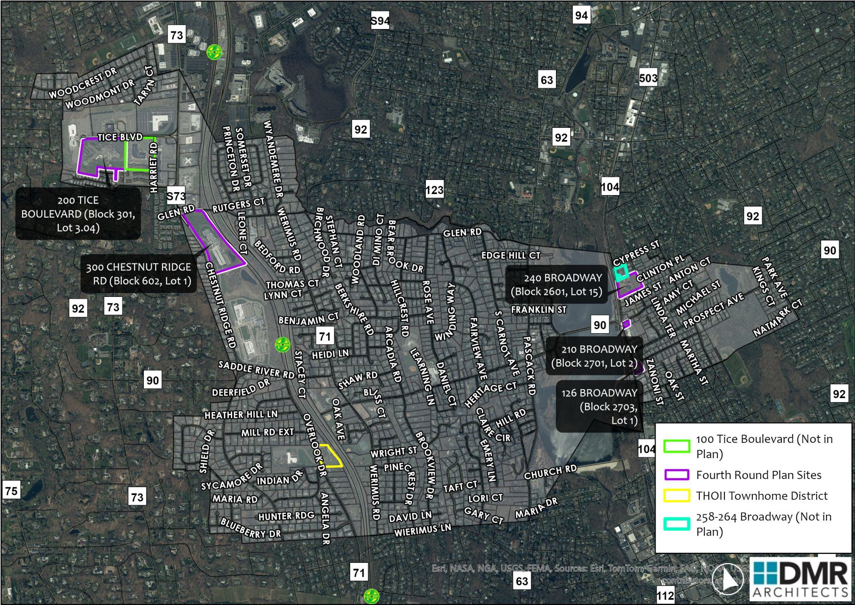
Map 3. Lands Considered for Affordable Housing